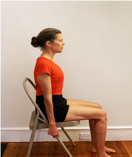
Fig. 1: Tadasana (mountain pose)

In these uncertain times you may find your mind racing with worry and negative thoughts. What can we do to counteract these feelings? The ancient Indian sage Patanjali advises when the mind is disturbed by negative thoughts, cultivate the opposite. When we are feeling low, hopeless, anxious or agitated, practicing yoga can help. Start small, one step at a time, by using your body and breath to cultivate a positive mindset. These simple chair yoga poses (asanas) will help get you started.